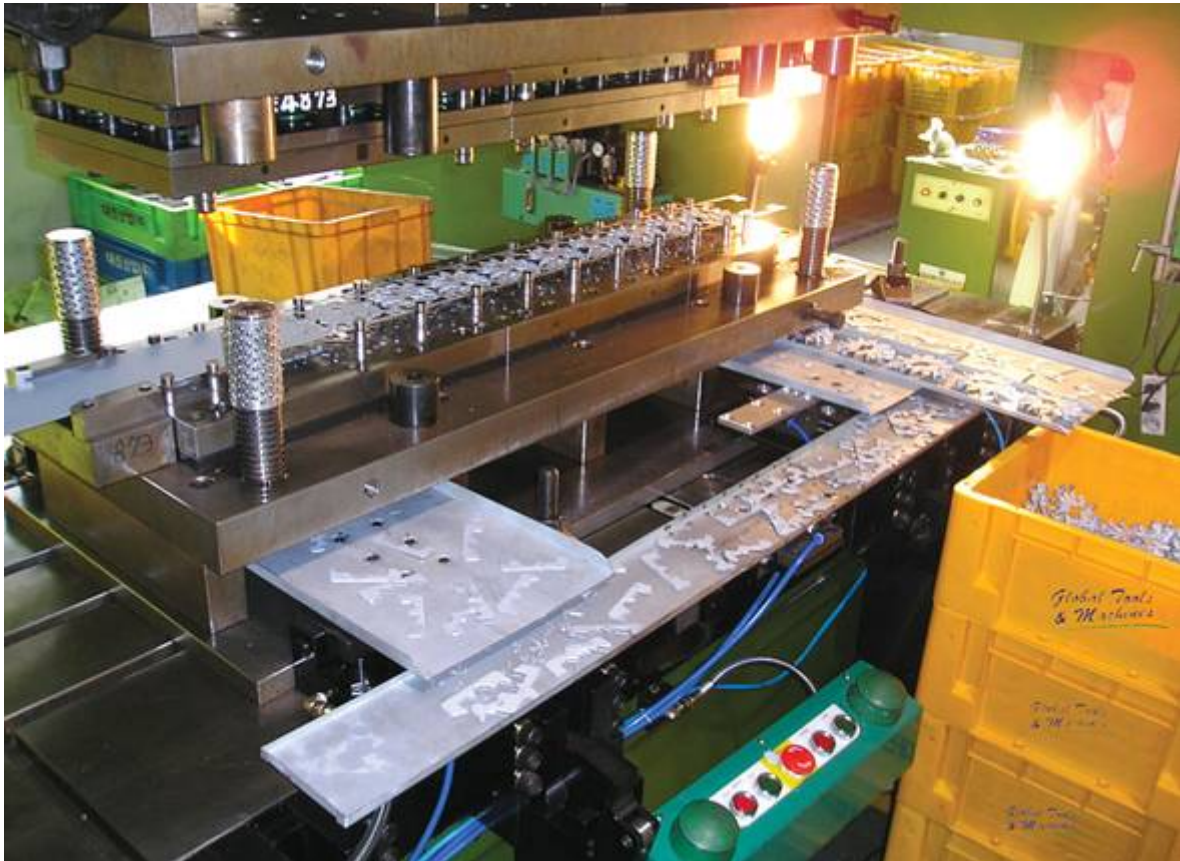
The Shaker Conveyors with custom trays create a simple solution for scrap and part removal.